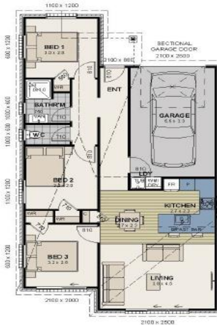
2B Meridian Place